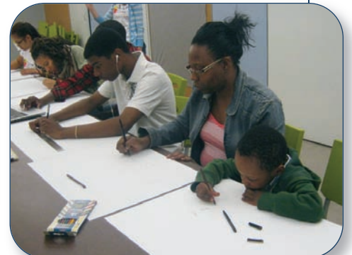
Parents and children work together on an art project